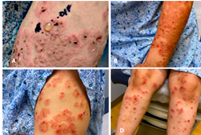
Figure 1A-D. Widespread urticarial plaques with tense bullae over the patient's arms and legs are shown.

History. The patient's history was remarkable for biopsy-confirmed dermatitis during the third trimester of a prior pregnancy. Direct immunofluorescence (DIF) at that time was non-contributory. Because her dermatitis had not completely resolved postpartum, she was placed on dupilumab 300 mg every other week. Because of persistent pruritus of the hands and feet, she was placed on tralokinumab 300 mg injections every other week for 3 months. She was asymptomatic prior to her current presentation. On physical examination, widespread urticarial plaques progressing to tense bullae were noted on the arms ( Figs. 1-3 ) and legs ( Fig. 4 ). The eruption extended over her trunk. The remainder of her physical examination was unremarkable.